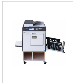
Duprinter | DP-X850