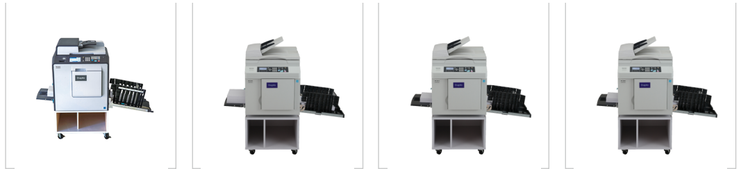
Duprinter | DP-X510 > Duprinter | DP-G325 > Duprinter | DP-G315 > Duprinter | DP-G305 >