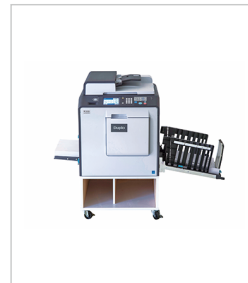
Duprinter | DP-X550