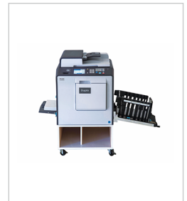
Duprinter | DP-X520