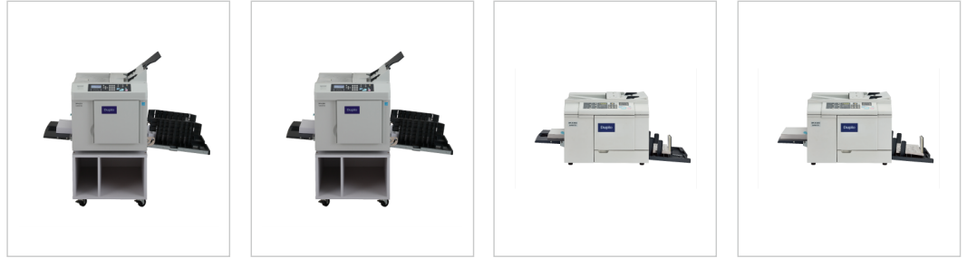
Duprinter | DP-G215 > Duprinter | DP-G205 > Duprinter | DP-A120II/A125II > Duprinter | DP-A100II/A105II >