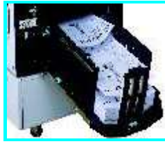
'U' shape stacking tray