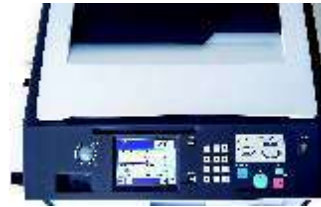
4 colour touch panel