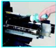
Ejection core technology